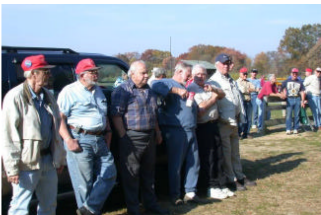
The flight line wasn't quite as congested as the turkey line.