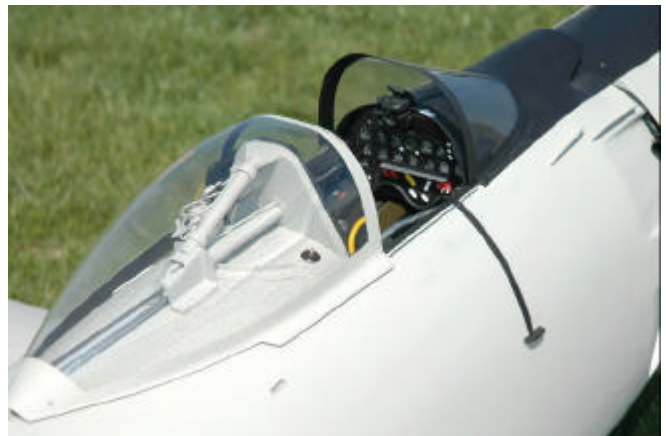
Impressive detail work was part of the reason.