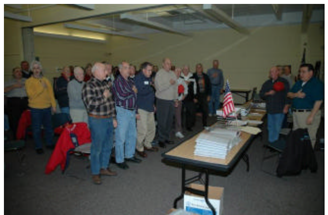
Awards Night drew one of the biggest crowds of the year, which began with the Pledge of Allegiance.

The Annual Awards Meeting was held on December 7 th at the Lawrence Branch of the Mercer County Library.